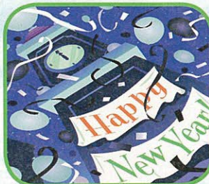
New Year's Day